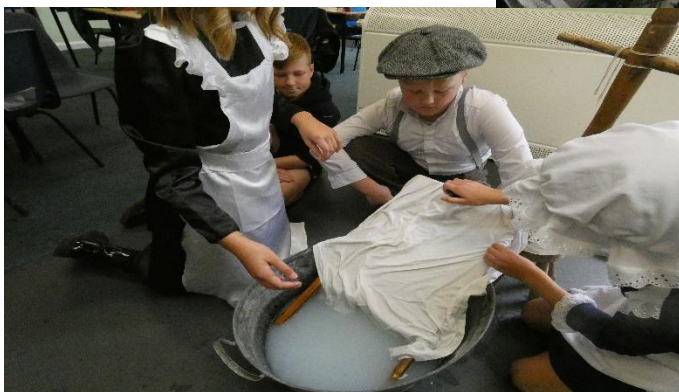
Year 6 enjoyed a Victorian day to start their topic on the Victorians.